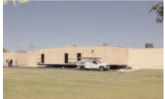
Mobile classroom buildings such as this one being set up at Elaine Wynn Elementary School are easier to move since the Clark County, Nevada School system started using Meltric switch-rated plugs and receptacles instead of hard wiring electrical power