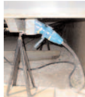
A male inlet is installed at the mobile classroom corner opposite the panel. The female connector is easily mated to the inlet providing a safe and neat power connection.

To date, approximately 350 of the portable buildings have been equipped, with more than 100 additional devices ordered. Looking to the future, the District now is ordering all new portable buildings to be equipped with the Decontactors. Mr. Crocker says, "They will be pre-wired at the factory, so all we have to do before we plug them in is to check to see they are wired properly."