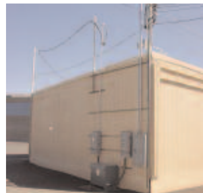
Previously, conduit and overhead wires like this had to be removed each time a building was moved, then new ones cut and installed at the next location.

Each time a building is moved, electrical power must be disconnected and reconnected at the new location. Previously, this entailed disconnecting all the wiring and conduit before moving a building and again repeating the process once the buildings are in place at their new location. Typically, it takes one or two journeyman electricians eight hours or more to run all of the needed conduit and wiring to reconnect one modular building. Mr. Crocker worked with Matt Guild of Nedco Supply, Las Vegas, to implement a better way to make these connections.