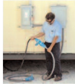
Compared to hard wiring, connecting the switch-rated plugs and receptacles on the extension cord that runs power to the opposite side of a portable building is safer, faster and easier.

Disconnecting a classroom is a simple operation that is initiated by pressing a pawl on the Decontactor, which causes it to break the circuit and eject the plug to its rest position. Then, a simple quarter-turn of the plug allows it to be totally withdrawn from the receptacle in complete-safety, since the circuit is already dead. While the plug and receptacle are separated, electrical safety is ensured because a safety shutter on the receptacle prevents access to live parts.