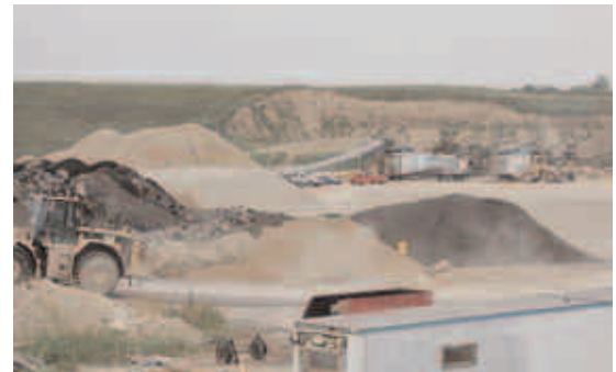
Portable conveyors and crushers at this Payne & Dolan aggregate operation are easier to move as they follow the material source because Meltric plugs and receptacles simplify power connections.

Schreurs says, "We add conveyors and keep following the material until we get to the property boundary lines." The ease of disconnecting and reconnecting with the Meltric devices speeds up and simplifies the moves, he notes. According to Schreurs, they are used on all the crushers, screens and conveyors at the site except for the few that are hard-wired and not moved. Disconnecting power to equipment is a simple operation that is initiated by pressing a pawl on the Meltric