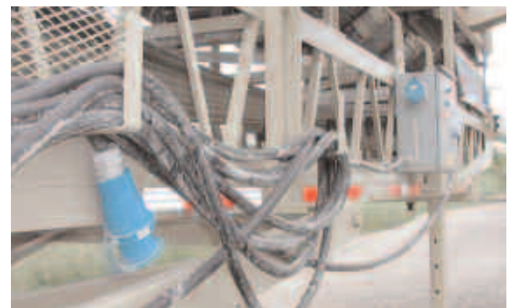
Typical portable conveyor setup includes Meltric plug and connector on panel and power cord. Easy twist connection is not affected by grit like the threaded nut on previous pin-and-sleeve connectors.