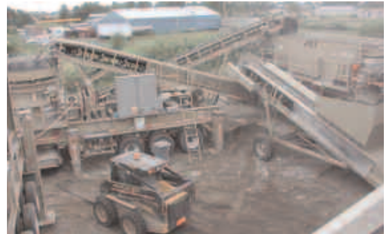
Portable crushing plant is moved frequently, so ease of making power connections is important.

Another application is a portable crushing plant the company moves frequently to temporary jobsites. Recently it was set up to crush recycled concrete near a repaving project. "We've moved four times since spring," a company spokesman at the site said in mid-summer. The plant has been used to crush limestone and to provide crushed aggregate at asphalt plants in addition to the concrete. According to the spokesman, it takes about eight hours to set up the plant at a new location. He says the ability to make the many required connections quickly and easily helps get the plant up and running faster than when the troublesome pin and sleeve connectors were used.