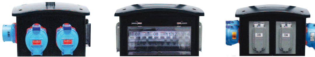
Power receptacles, circuit protection and convenience outlets are available in a variety of configurations and sizes. Standard boxes provide NEMA 3R watertightness.

In particular, large facilities such as mines, shipyards, and construction sites will benefit from being able to utilize Meltric Deconnectors to distribute power for welding, lighting, pumps and other electrical equipment.