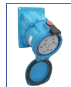
Female Receptacle with Angle Adapter 33-34540 + MP6