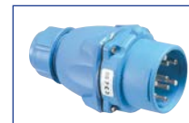
Male Inlet with Handle (Plug) 33-38540 + FH611

A typical order should include an inlet part number, a receptacle part number AND the matching handles, angles or other required accessories.