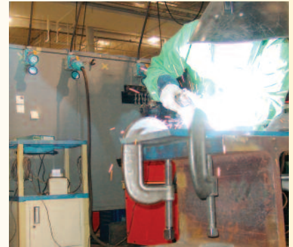
Switch rated welding receptacles (background) are connected to overhead busway system via cord drops.