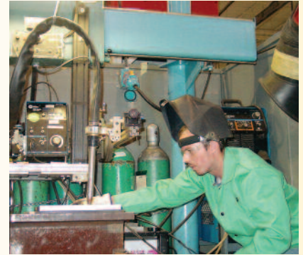
Switch rated plug and receptacle (background) enables technician to safely deenergize and relocate welding equipment.