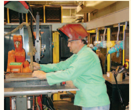
Switch rated plugs and receptacles eliminate the need for auxiliary disconnect switches at the ground level, saving space and connection time.