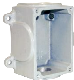
MB3 Box and Mounting Screws Not Included

Nylon 30° angle facilitates the mounting of a DSN20 or PN20+ to a MB3 box. Each kit includes a Nylon 30° angle, angle gasket, and a pack of four screws.