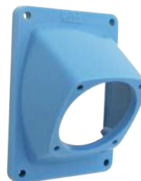
Nylon 30° Angle