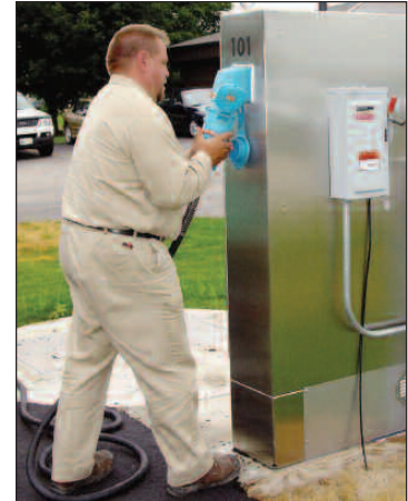
Making 100A generator connections at a lift station in Watertown, WI.

The ability to connect or disconnect quickly and safely makes it easier to move generators around to various lift stations for monthly test runs or if necessary during a prolonged or widespread power outage. Arc flash can be a concern when it becomes necessary to use mobile generators for emergency power, but the city's lift stations are now constructed to minimize or eliminate this risk. Freber explains, “Using the Decontactor to connect to the generator with this arrangement we can switch safely from city to emergency power.” Now, it takes only minutes to connect a generator and begin pumping.