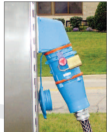
During test runs the plug is locked in the connected position to prevent injury to unauthorized people who might try to remove it.