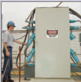
Meltric plugs and receptacles are durable in harsh environments.