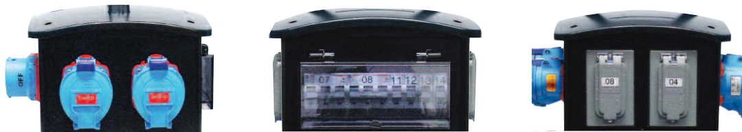
Power receptacles, circuit protection and convenience outlets are available in a variety of configurations and sizes. Standard boxes provide NEMA 3R watertightness.

In particular, large facilities such as mines, shipyards, and construction sites will benefit from being able to utilize Meltric Deconnectors to distribute power for welding, lighting, pumps and other electrical equipment.