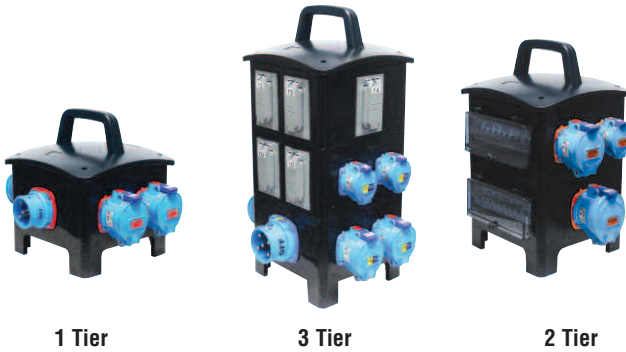
Rubber boxes are offered in one, two and three tier configurations

Meltric now offers Rubber Power Distribution Boxes in both standard and custom configurations. These boxes will provide a compact, durable solution for portable power distribution needs.